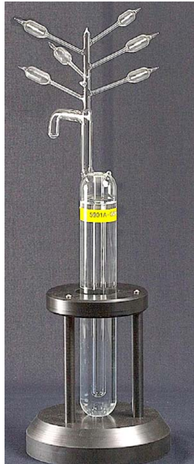
Fig. 2 TPW cell for isotopic composition and impurity analysis. The ampoules that were removed periodically for water testing are shown

In order to track the rate at which impurities leach from the containment envelope to the water sample and to determine whether fused-quartz might be a better material for TPW cells, specially designed TPW cells (one with borosilicate glass and one with fused-quartz envelopes) were manufactured in 2005. Each cell had six attached ampoules. We removed one ampoule every 6 months, providing a means to analyze the water periodically and track the purity of the water over time. Figure 2 shows this uniquely designed TPW cell. Two ampoules from each cell were removed immediately